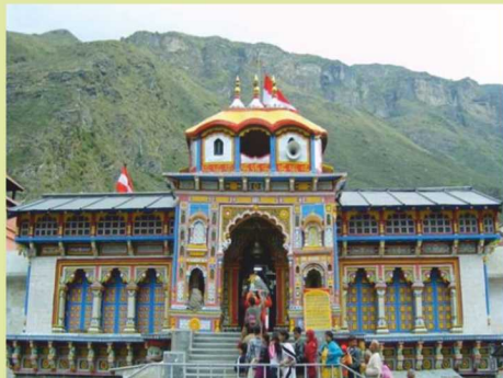
Retreat at Badrinath Date : 7-15 October 2018